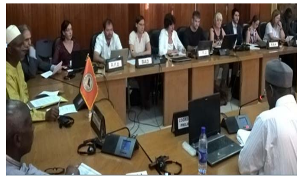
Presentation of the results of the studies on modelling

aquifer by means of the method of magnetic resonance of protons (RMP Method);