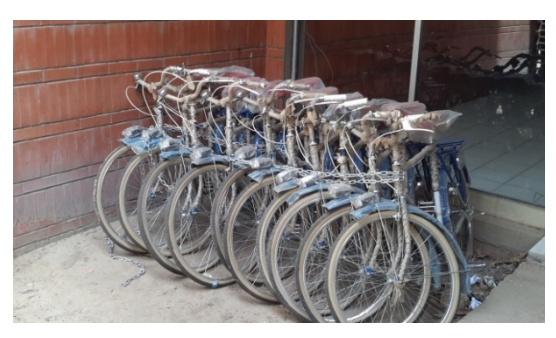
Donation of bicycles in Cameroon