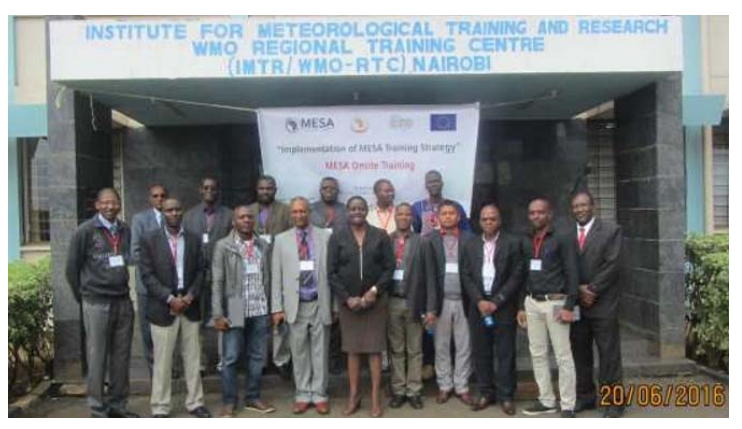
During MESA's Workshop in Nairobi, Kenya

Finally, the African Union, through its BIRA Office, is proposing to fund the