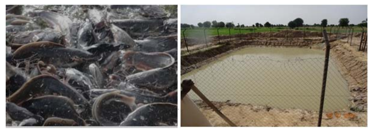
Development of aquaculture in Nigeria

Based on results obtained during the initial fish harvest, Governors of recipient states committed themselves to popularizing these fish farming techniques and to providing support to those who would like to create their own business in the aquaculture sector.