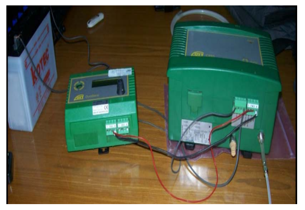
DuoSens recorder for hydrometry