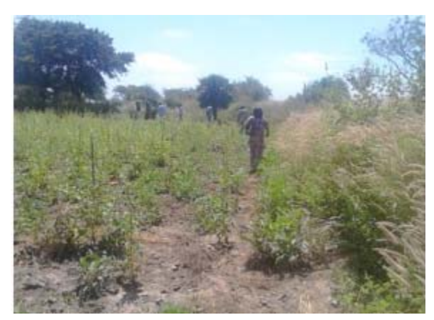
Sesame farmland at Guelendeng, Chad

For agroforestry activities, LCBC has planned the development of degraded lands in the most sensitive areas through the plantation of feedgrade and fertlizer species with a view to reducing ecosystem stress, rehabilitating degraded lands, and conserving and harnessing in a sustainable manner biodiversity. Species to be used should be resistant to water stress and capable to improve the fertility of soil through nitrogen mineralization and the production of a litter. The core issue is to address the root causes of the degradation through participative activities.