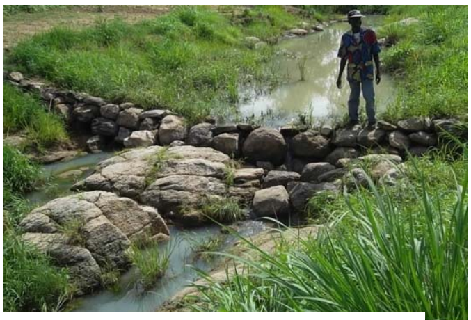
Calibrated stony millstream at Lara, Far-North Cameroon

The Lake Chad Basin Commission committed itself to increasing the productive capacities of the lake and to restoring the ecosystems of its basin in a sustainable manner through soils defence and restoration projects and programmes. These activities include the execution of CES/DRS related activities on fertile lands through the various techniques tried out in some member countries. The works cover 3,150 ha and include stone belts, banks, terrace, bowls, scarps, zaï, chiseling, spillway crest and earth dikes.