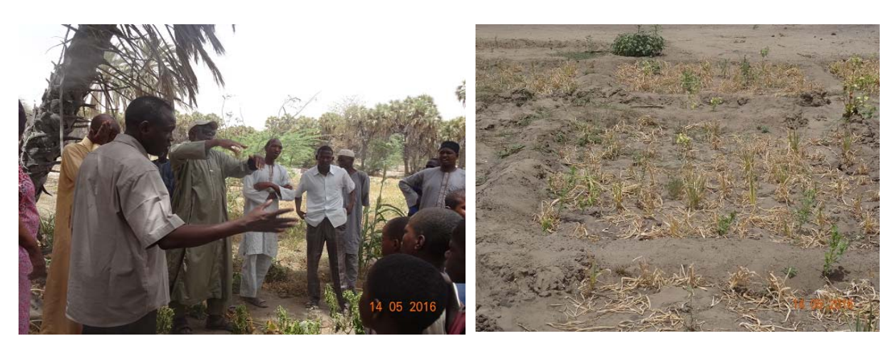
The NGO "Agir Plus" working in the field in Niger

For a smooth conduct of its activities, LCBC, with the authorization of local authorities, signed a Memorandum of Understanding (MoU) with the NGO "Agir Plus" to ensure the supervision and monitoring of beneficiaries.