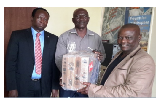
Donation of two computers (lap top) in CAR