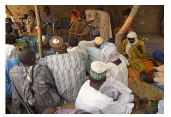
Meeting with a community grouping (Diffa)

Metadata collection (data on data) consists in collecting data packets on water resources, environment and socio-economy. Recent hydrogeological maps were