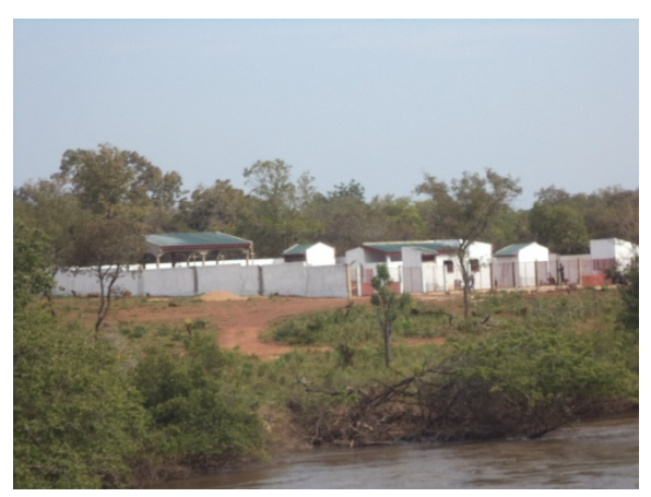
Construction of docks at Bozoum, CAR

The aim of the actions proposed to improve the livelihoods of communities is to increase the resilience of socio-economic activities with a view to addressing climate change effects and developing production systems in a sustainable manner. They include integrated water resource management activities, sustainable forest resource management, agroforestry plantations and sound management of fishery resources as well as sustainable local development alternative initiatives. Several actions were conducted by PRODEBALT, notably the construction of biogas units and the distribution of Chorkors ovens, drying stages and isotherm containers.