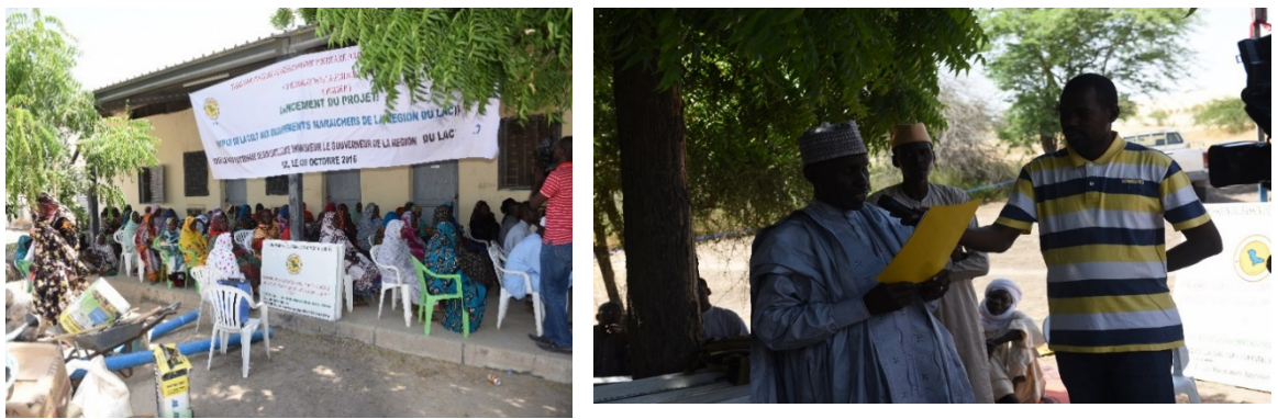
NGOs "ASDED" and "Saving Lake Chad" working on ground

Both local traditional and administrative authorities highly commended the initiative and expressed their hope that such an initiative will be extended to take into account socio-economic activities. This will also improve the visibility of LCBC.