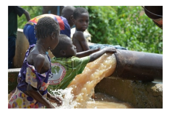
Water catchment on the Logone River at Zimado, Far North Cameroon