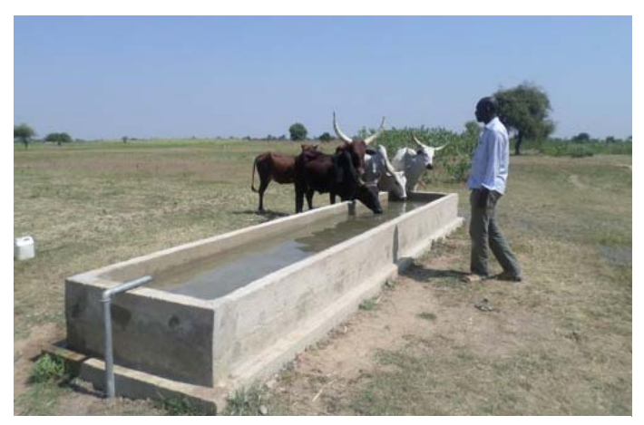
Pastoral wells at Mandjakma, (Tchatibali), Far-North Cameroon

The constructions of pastoral wells equipped with solar or electric submerged pumps for cattle watering were completed. In 2016, five (5) pastoral wells were constructed in Cameroon, 19 wells in Chad and 18 in Niger.