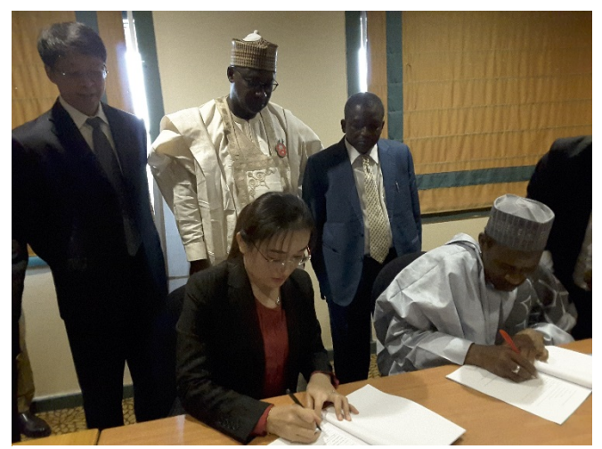
Signing ceremony of the MoU

Powerchina has among other things agreed to finance itself to the tune of 1.8million US Dollars.