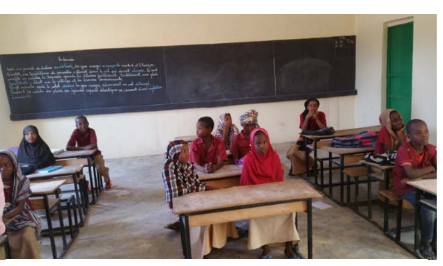
Construction of schools, Far North Cameroon

LDFs comprise a primary window (or component) relating to facilities outlined in local development plans (PCD) and a second window dedicated for Income Genarting Activities (AGR).