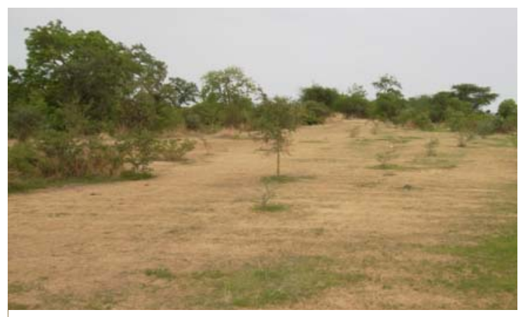
Restoration of reserved forests at Zamay, Far North Cameroon

The community reforestation consists in bringing populations to restore degraded areas through the production, plantation and management of plants. The aim of this activity is to contribute to the development and sustainable management of forest resources of the site, and to improve the living conditions of populations whose livelihoods depend on these resources by: (i) strengthening the